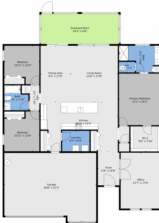
Floor Plan Created By V1photos.com, Measurements Deamed Highly Reliable, But Not Guaranteed.