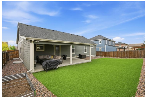
56640 East 23rd Place, Strasburg, CO 80136 - floorplan_single_0